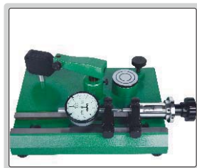
inspect accuracy of dial indicators (range 0-25mm)