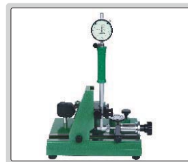
inspect accuracy of dial bore gages (range 6-450mm)