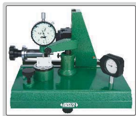
check repeatability of dial indicators