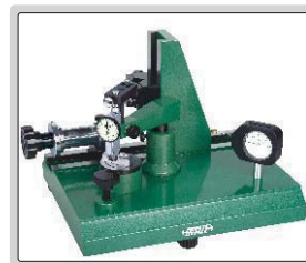
check the effect of lateral force on accuracy of test indicators (half round gage block is required)