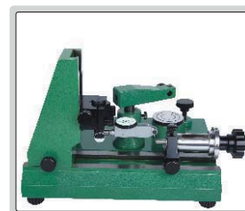
inspect accuracy of test indicators