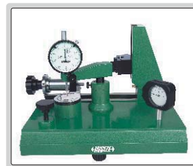
check the effect of lateral force on accuracy of dial indicators (half round gage block is required)