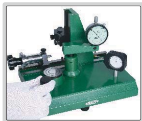
check force of dial indicators