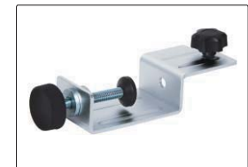
stand (included with outdoor detector)