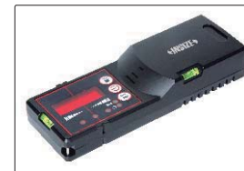
outdoor detector (optional)

* Use high accuracy detection mode within 15m, use low accuracy detection mode over 15m