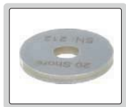
calibration block (included)