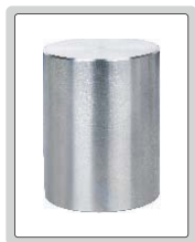
4kg weight block (optional) for ISH-S30D