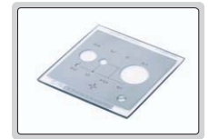
calibration plate (included)