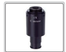
1X camera adapter (optional)