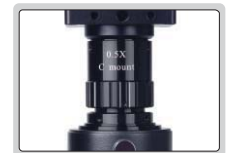
0.5X camera adapter (included)