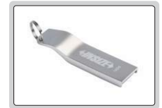
16G USB flash disk (included)