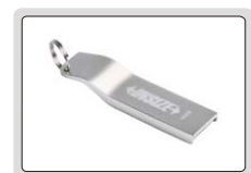
16G USB flash disk (included)