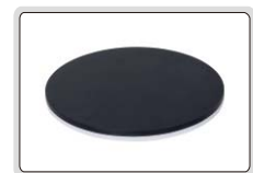
white/black plate (included)