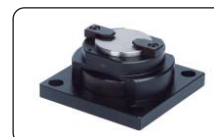
slice holder (included)