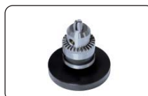
cylinder holder (included)