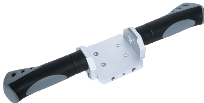
push test with single handle