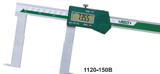
1120-150B type B