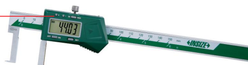
1120-150A type A