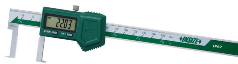
1120-150P type C

Non waterproof, preset (no need to add the width of the jaws on the reading), with data interface