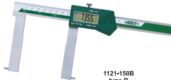
1121-150B type B