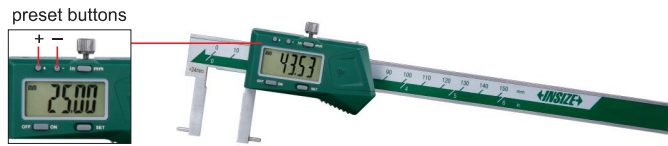
1121-150A type A